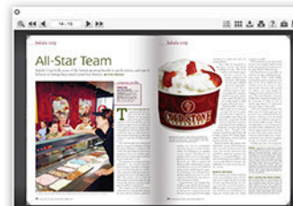
DIGITAL FLIP BOOK

Digital flip books can be placed on your website or emailed to new clients for unlimited use and take your message to the next level.