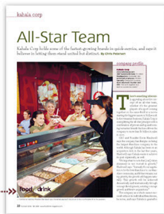
FRONT (page 1)