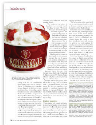
BACK (page 2)

Brochures are printed on high-quality paper and can be turned around in ten business days from the day you approve your brochure layout!